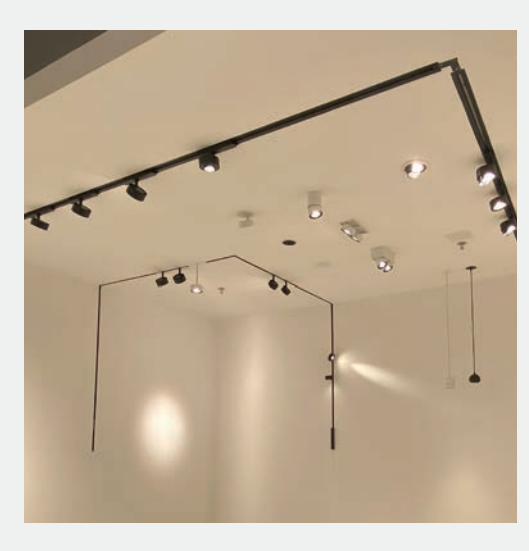
LIGHT FIXTURE FAMILIES