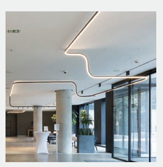
CUSTOM ARCHITECTURAL LINEAR