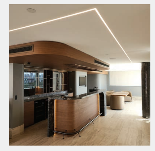
LED STRIPS TRIMLESS DRYWALL PROFILES