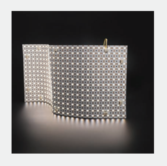
LED SHEETS FOR BACKLIGHTING