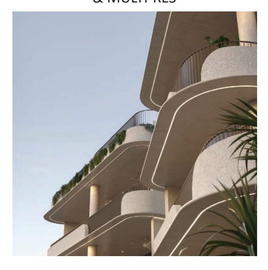
HIGH-END RESIDENTIAL & MULTI-RES