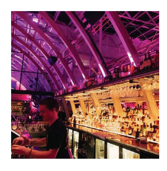
BARS & RESTAURANTS