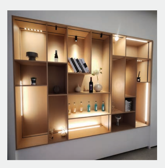
SLIM MAGNETIC TRACK