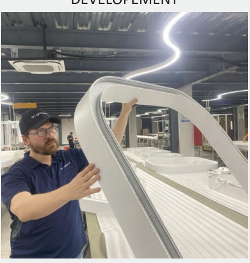
CONTINUOUS PRODUCT DEVELOPEMENT