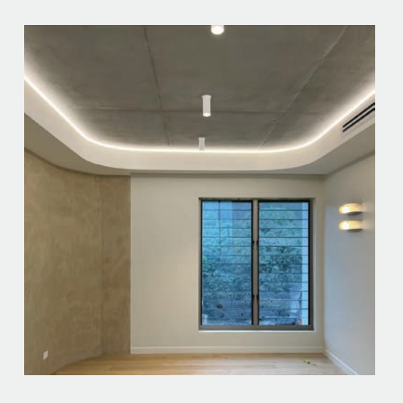
COSTUM LED NEON